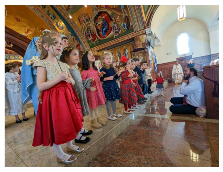
Sunday School Nativity 2022