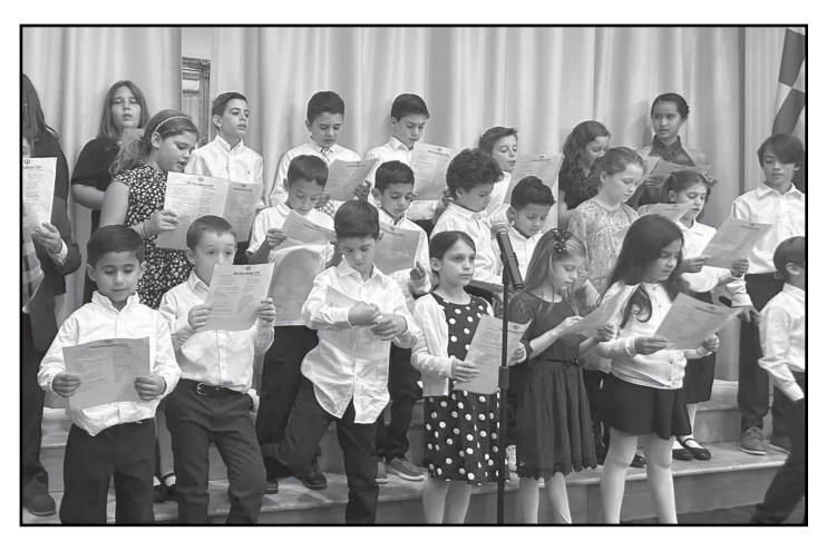
Our students singing "Koroido Mussolini"

Για τον Ιανουάριο το σχολείο μας θα ετοιμάσει άλλη μία γιορτή προς τιμήν των Τριών Ιεραρχών και της γιορτή των Γραμμάτων. Σε αυτή τη γιορτή θα έχουμε την ευκαιρία να φιλοξενήσουμε και το Ελληνικό Σχολείο της Αγίας Βαρβάρας του Toms River.