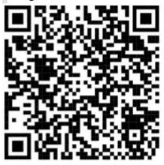
Check out our website for general and Oratorical Information tinyurl.com/StGSundaySchool2022