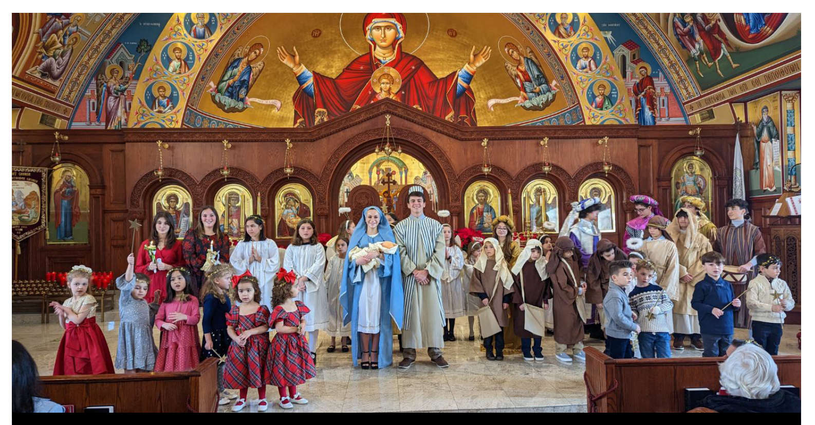
Thank you to everyone who came out to participate in, help out, and celebrate with us as we brought the annual Nativity Pageant back to our St. George Community.